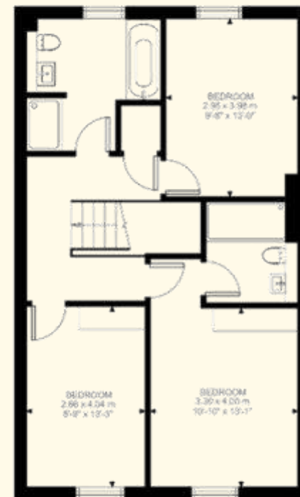
Second Floor 686 ft 2

Pavilion Green East, DT1 Approximate Gross Internal Area 216.82 SQ.M / 2334 SQ.FT